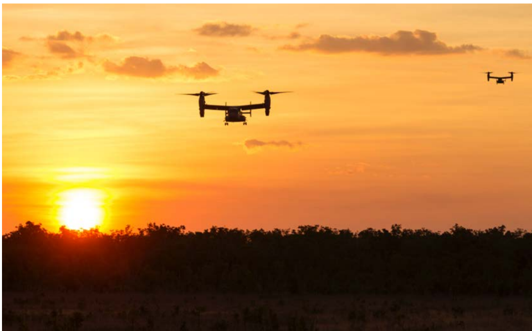
Two United States Marine Corps MV-22 Ospreys prepare to land at Mount Bunday Training Area, Northern Territory, during Exercise Talisman Saber 17 Field Training Exercise - North.